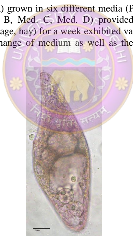
Figure-I: Photomicrograph of a live cell of Blepharisma sp. Scale bar represents 20 \mu\text{m} .

Blepharisma sp. (Figure-I) grown in six different media (Pringshiem's Medium, Hay Medium, Med. A, Med. B, Med. C, Med. D) provided with four different food sources (wheat, rice, cabbage, hay) for a week exhibited variation in cell number, size and pigmentation with change of medium as well as the food source (Table I-VI, Figure-II).