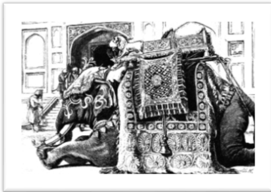
Figure 1 ‘ Waiting for the raja ’

elephant itself, though, he is careful to treat it realistically. JLK positions the fore and hind legs exactly as Tennent—detailing his observations—recommends. “The real peculiarity in the elephant in lying down is, that he extends his hind legs backwards as a man does when he kneels, instead of bringing them under him like the horse or any other quadruped.... It is to the structure of the knee-joint that the elephant is indebted for his singular facility in ascending and descending steep activities...” (Tennent 1861: 109). JLK’s draughtsmanship gives the reader an elephant that is at least as true to life as it is exotic. He holds on to this commitment even in his later collaboration with Flora Annie Steel when he illustrates a collection of Indian folktales. The particular story that he handles, ‘The two brothers,’ requires an elephant to identify the hero of the story by bowing low before one of the characters. Here too the initial impression is that of a slightly melodramatic fantasy. The frame of the picture is a Saracenic archway, but just when we are about to dismiss it as a piece of tawdry fantasy, the elephant’s posture holds our attention. Its fore legs begin to go down, but its hind legs start to splay out backwards, and we realize we are again looking at everyday reality in the midst of an otherwise escapist parable.