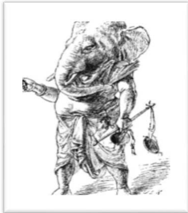
Figure 3 ‘Ganesha: From an ancient Hindu sculpture’ Figure 4 ‘If Ganesha stood’